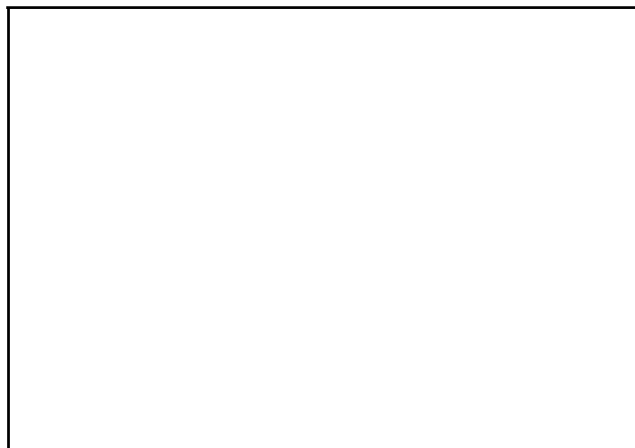
Fig. 3. Links between formal plant breeding, farmers and informal seed system.

Figure 3 illustrates that participatory plant breeding can not be limited to ad hoc studies conducted for a limited period to document indigenous knowledge and farmers' preferences. To be completely effective, participation should become a permanent feature of plant breeding programs addressing crops grown in agriculturally difficult and climatically challenging environments. For crops grown in remote regions, or for those considered as minor crops and therefore neglected by formal breeding, this could be the only possible type of breeding.