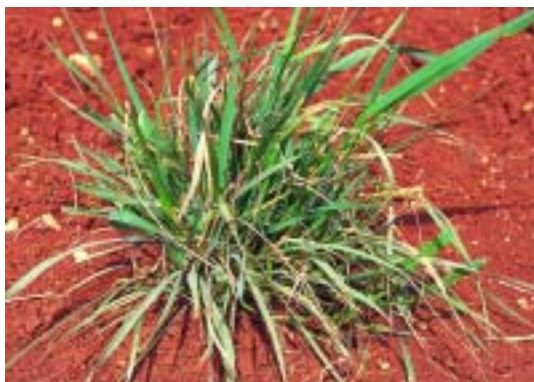
Sunn pest infected wheat plants.

Sunn pest causes severe damage to wheat and barley crops in Central and West Asia, with infestations spreading over 15 million hectares. It causes the damage by feeding on leaves, stems and grains. Yield loss is commonly estimated at 20-30% in barley and 50-90% in wheat. Apart from the direct reduction in yield, the pest also injects chemicals that greatly reduce the baking quality of the dough. Control of Sunn pest by chemical insecticides is expensive, costing over US$ 100 million annually in the countries of Central and West Asia, and poses a risk to human health, water quality and the environment. In Turkey, about 1.5 to 2 million hectares were sprayed against this pest in the past. Efforts to replace the insecticide-based strategies for Sunn pest control with integrated pest management (IPM) options have led to a reduction in the sprayed area to less than 1 million hectares.