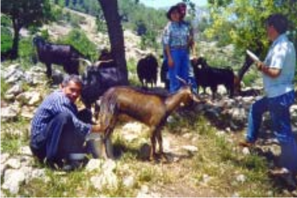
Measuring milk yields in the Taurus Mountains, Turkey.

The project led to the development of improved varieties of wheat, barley and chickpea which have been widely adopted by the farmers. Also, new enterprises were introduced to diversify the incomes of farmers. These included the vetch-oat combination, triticale, sainfoin, and new fruits such as cherry and grapes. Livestock production was also improved. The changes of breeds in animals (cattle, sheep and goat) significantly increased the incomes of farmers. As a result of these technological changes, the incomes of the farmers involved in the project increased by 65%. This project may be considered a model for agricultural development through research, with the participation of farmers, extensionists and researchers.