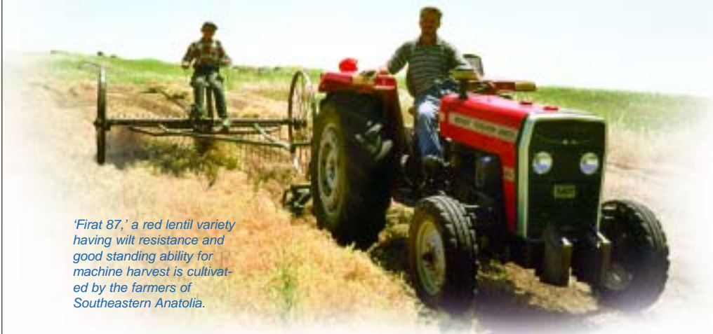
'Firat 87,' a red lentil variety having wilt resistance and good standing ability for machine harvest is cultivated by the farmers of Southeastern Anatolia.

Southeastern Anatolia, where lentil is grown on about 350,000 hectares, mostly the red type, is the most intensive lentil-growing area in the world. However, the region faces a major problem of wilt, which limits production. SARRI is working with ICARDA to develop wilt-resistant, high-yielding red lentil varieties for winter planting. Among the varieties released, 'Firat 87' and 'Syran 96,' which combine wilt-resistance with good standing ability for machine harvest, have been adopted by the farmers in Southeast Anatolia. 'Firat 87,' locally known as "Commando," is popular with consumers for its roundish seed shape. Recently, ICARDA supplied 19 tons of a popular variety 'Idlib-3,' released in Syria, to Turkey to increase adoption and impact. SARRI has also selected a large number of ICARDA germplasm from international nurseries for use in hybridization and further evaluation in various parts of the region.