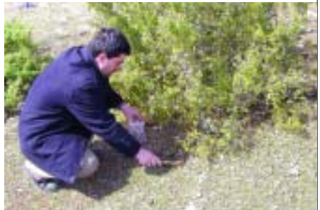
Sampling of entomopathogenic fungi in Gaziantep, Turkey, for their persistence against Sunn pest.

In Turkey, IPM options have been extended to farmers using farmer field schools formed around each of two IPM pilot sites. The main challenge to implementing IPM options for Sunn pest was reliance on chemical control. However, efforts by scientists from Turkey and ICARDA have led to some progress in the use of IPM. Starting from the 2004/2005 season, the Government of Turkey decided to replace the centralized aerial spray with ground application by farmers. This decision will encourage IPM implementation in the country. A national IPM program supported by the Government of Turkey was launched recently, through which farmer field schools will be established throughout the Sunn pest affected areas in the country.