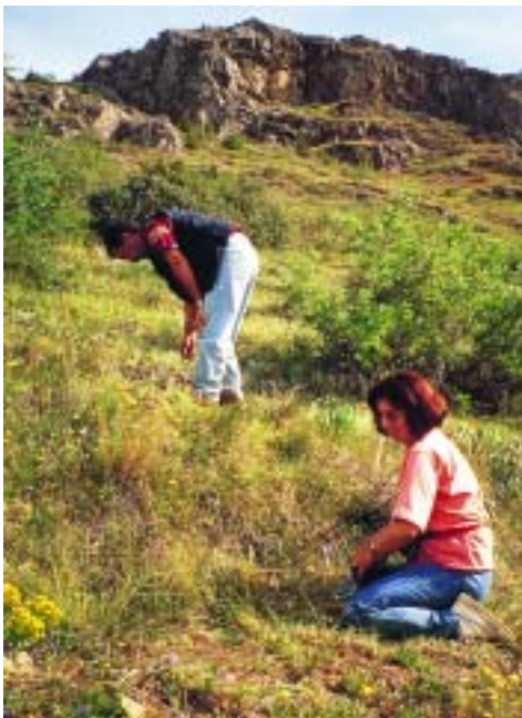
Collecting wild relatives near Burdur in Turkey as part of a joint collection mission of ICARDA and the Aegean Agricultural Research Institute.

Many of the crops that were originally grown in Turkey have adapted to cold and drought, pests and diseases, and can be useful in breeding varieties with similar traits. Given the country's diverse agroclimatic conditions, similar to those in various parts of the world, especially in the dry areas, ICARDA has a collection of 11,359 germplasm accessions from Turkey, the second-largest collection of germplasm from a single country kept in the Center's genebank (Table 1). This helps to preserve the unique crop biodiversity which could otherwise be eroded by unsustainable agricultural practices. In addition, ICARDA shares germplasm from its collections with various agricultural research institutions in Turkey; and as a result more than 100 improved crop varieties have been released in the country (Table 2).