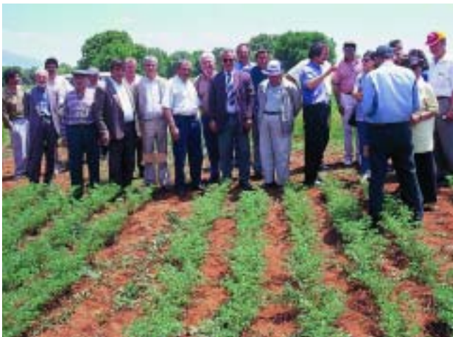
Researchers, farmers, extensionists, and processing industry representatives evaluate chickpea for producing leblebi (a popular snack) in Turkey.

Major activities have included evaluation of germplasm for cold tolerance at Hymana and Eskisehir research stations. A large number of cold-tolerant lines have been identified and used in the breeding program. In addition, a large number of chickpea lines resistant to Ascochyta blight have been identified from ICARDA-supplied materials for release in Turkey. One of these lines, 'Gokce' (FLIP 87-8C), which is large seeded, occupies more than 40,000 hectares.