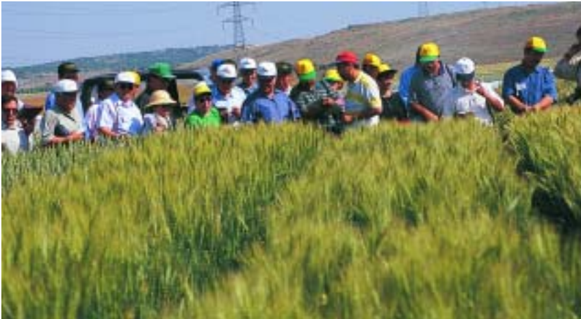
Traveling workshop in Turkey on winter wheat improvement.

The major aim of the project is to provide durum producers, especially resource-poor smallholders, with opportunities to improve their agricultural income and welfare by adopting productive, low-cost, sustainable technology options compatible with their production and consumption needs. It also provides feasible and low-cost alternatives for broadening the income base of smallholders through the development of income-generating activities, especially for women.