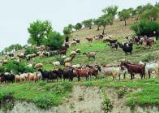
Improving range, forage and small ruminant production.

An on-the-job training program was then implemented for farmers, extensionists and researchers on improved technologies for small ruminant production. Four courses were conducted, one at ICARDA headquarters and three in the GAP area. The training efforts led to the introduction of new technologies such as use of agricultural and agro-industrial by-products, feed blocks, urea-treated straw, strategic feeding and