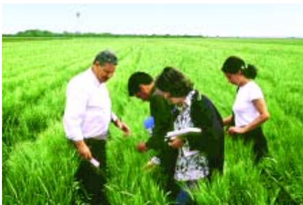
On-farm technology demonstration/testing and seed production.

The introduced material is monitored and evaluated by GAP staff, local extension personnel and ICARDA scientists. Improved cultivars of these crops in demonstration fields produce higher yields than local cultivars. Varieties derived from ICARDA germplasm that are now popular with GAP farmers include 'Gidara 2,' an improved durum wheat variety, chickpea varieties 'Gokce' and 'Diyar 95,' and lentil variety 'Firat 87.'