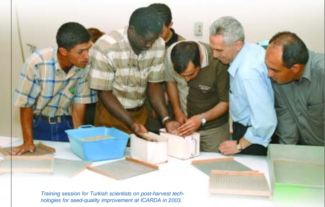
Training session for Turkish scientists on post-harvest technologies for seed-quality improvement at ICARDA in 2003.

One of the key components of ICARDA's work is the capacity building in national agricultural research institutions through training of scientists and supervision of post-graduate studies, short- and long-term training courses, conferences, traveling workshops and scientific seminars. More than 500 scientists from Turkey participated in training activities conducted by ICARDA from 1978 to 2004. Areas of training included seed production and technology, crop improvement, cereal physiology, biotechnology, food legume entomology, DNA molecular marker techniques, experimental station operations management, experimental designs and field plot techniques, expert systems, GIS/RS, natural resources management and data analysis, and scientific writing.