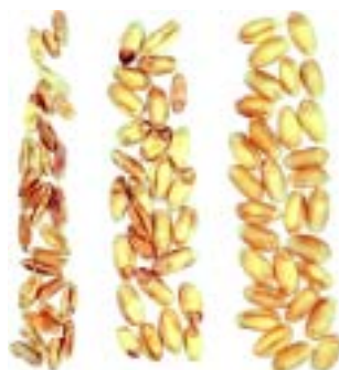
Sunn pest damaged grain (left and middle) and undamaged grain (right).

Turkey has been involved in various ICARDA projects aimed at controlling Sunn pest. One of the projects, funded by DFID, aims at reducing constraints to wheat production caused by Sunn pest through the development and application of appropriate, low-cost and environmentally acceptable IPM approaches. Since 2001, the project has been implemented in collaboration with NARS of Iran, Syria and Turkey and the University of Vermont (USA), CABI Bioscience and the University of Greenwich, UK. In Turkey, the collaborating institutions are the Plant Protection Research Institute, Adana; Adana Mustapha Kamal University; and the University of Cukurova.