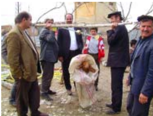
Determining the weight of a lamb during surveys conducted by the GAP/ICARDA team.

team to Jordan to see the cooperative milk production sector involving small-scale sheep milk producers.