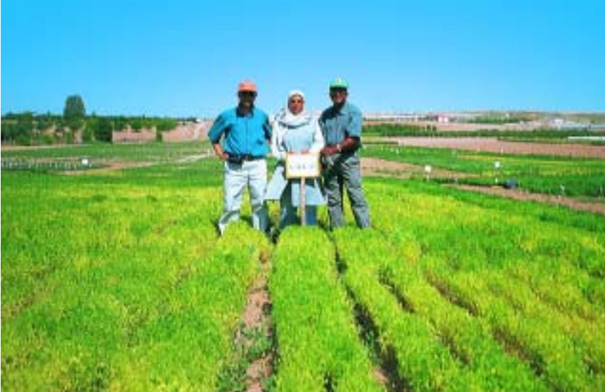
ICARDA and Turkish scientists evaluate the performance of 'Kafkas,' a high-yielding and winter-hardy lentil variety in Turkey.

to Ascochyta blight, and two high-yielding, early-spring varieties were released for Central Anatolia. The varieties are being disseminated among farmers mostly by the Mediterranean Seed Export Company. In addition, CRIFC researchers have identified some winter-hardy lines, which are now at various stages of evaluation.